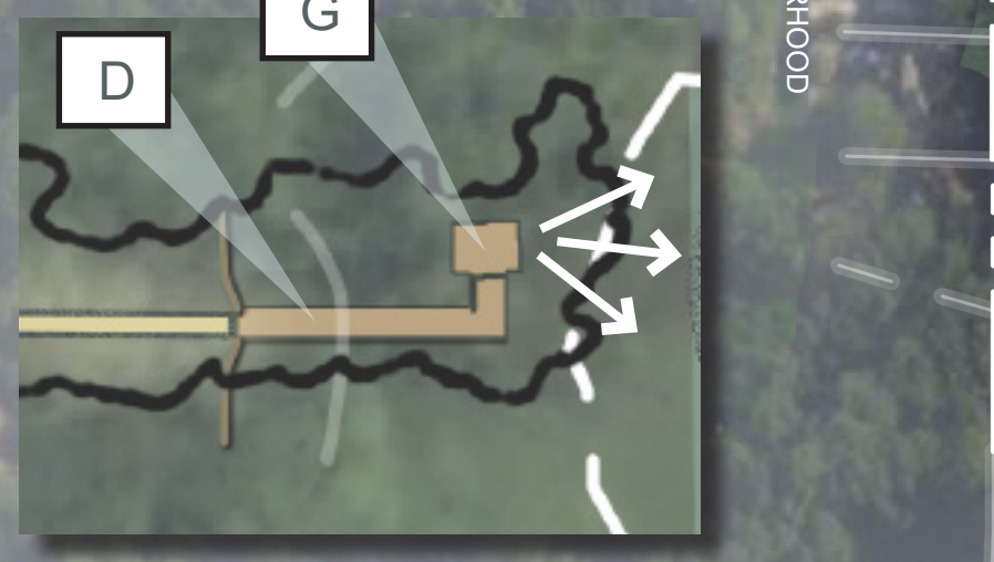
VIEWING PLATFORM ENLARGEMENT

N/F MILLER THOMAS S & JANE P TMS R200 010 000 054F 0000 DB: 2665 PG: 306