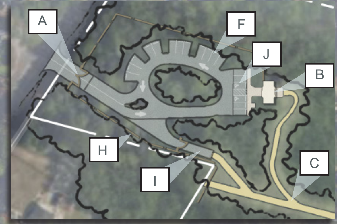
PARKING AREA AND RESTROOM ENLARGEMENT